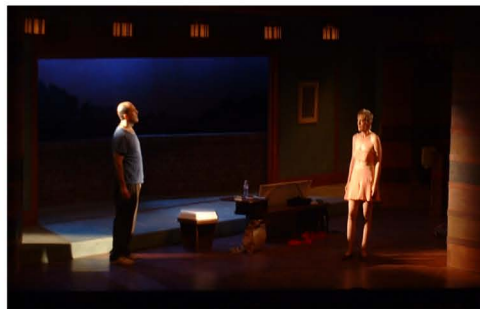
THE HOPPER COLLECTION The Magic Theatre, San Francisco