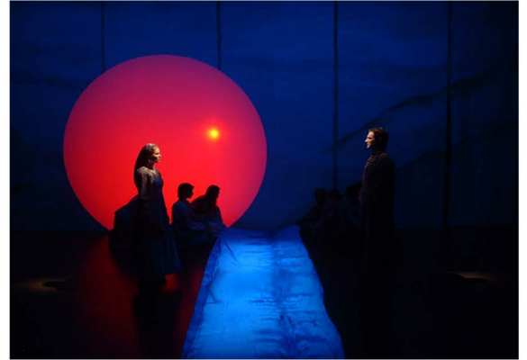
CAUCASIAN CHALK CIRCLE A.C.T San Francisco