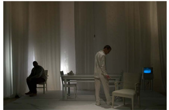
DOMINO Campo Santo, San Francisco